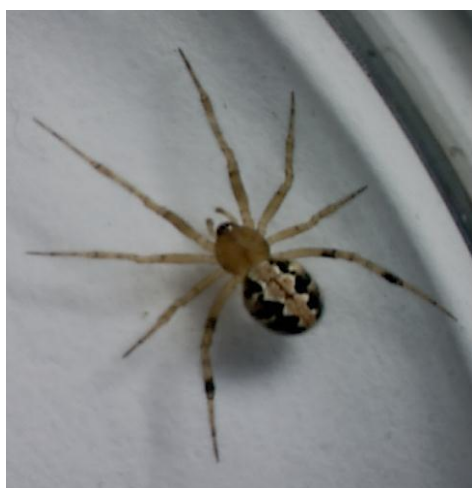
Fig. (2): Theridion incanescens Simon, 1890 adult female.